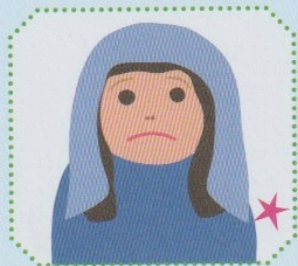
Mary was worried when the angel Gabriel first appeared.